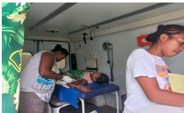
Delivery of mobile clinics services at the shelter sites