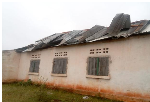
Health facility in Tsirandrary, Beraketa damaged by cyclone Jude