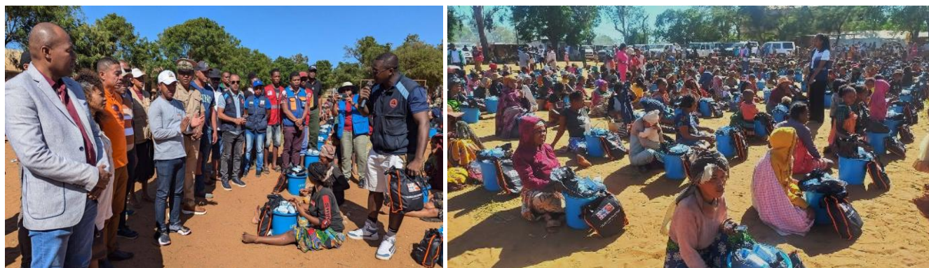
Distribution of delivery kits to 114 pregnant and breastfeeding women affected by cyclone Jude in Ambovombe.