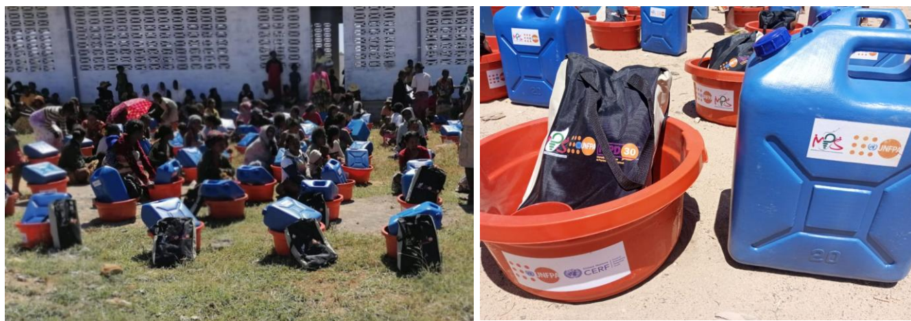
Distribution of 85 dignity kits to pregnant women, nursing mothers, women with disabilities and young girls affected by cyclone Jude in Ampanihy.