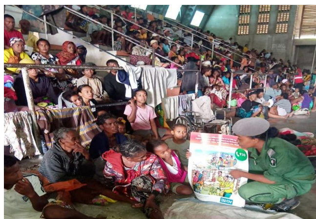
Raising awareness on GBV and SEA prevention at shelter sites