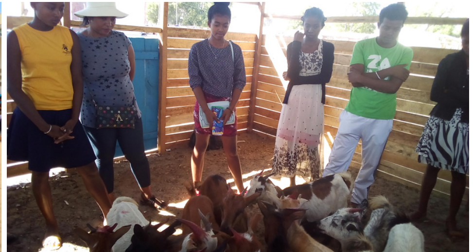
80 Young girls benefited from training in goat breeding & have become actresses for the promotion of Family Planning