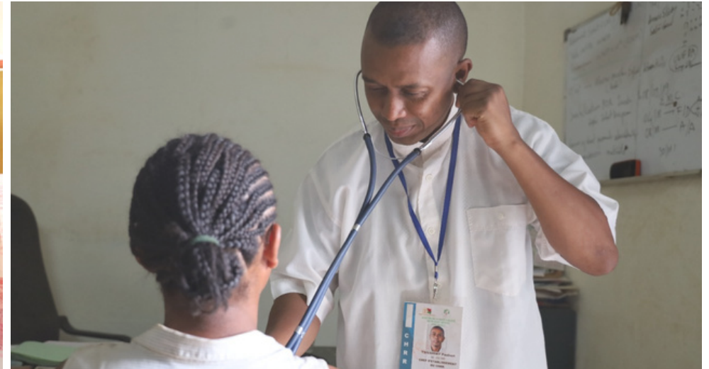
126 GBV survivors received medical care