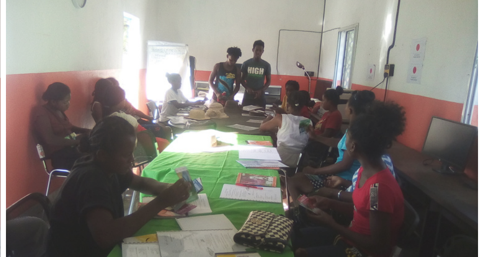
Youth Friendly Health Center set up in Beloha