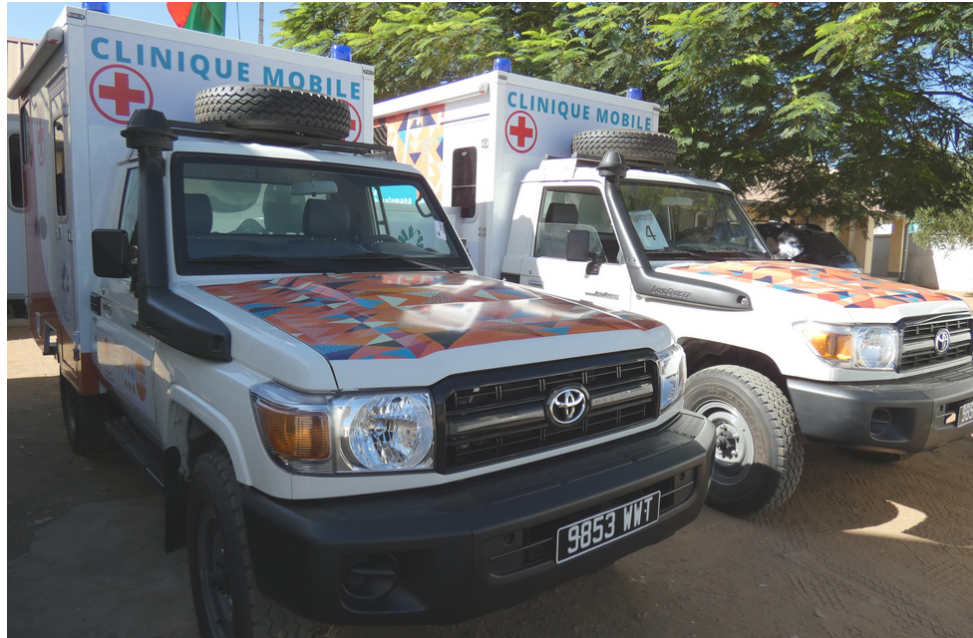
The two mobile clinics provided by the Government of Japan

Proximity health services/ Mobile clinics