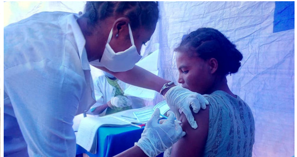
22 048 New Family Planning Users