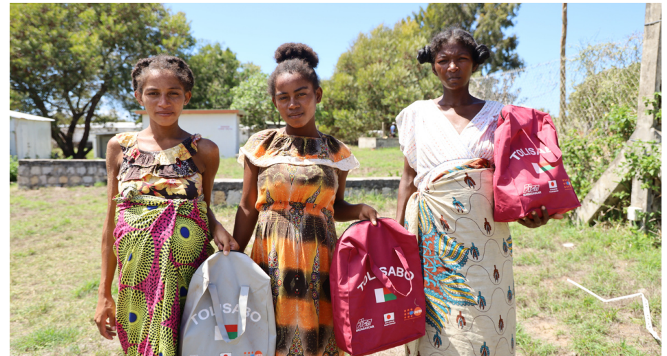
10 000 women received individual delivery and hygiene kits