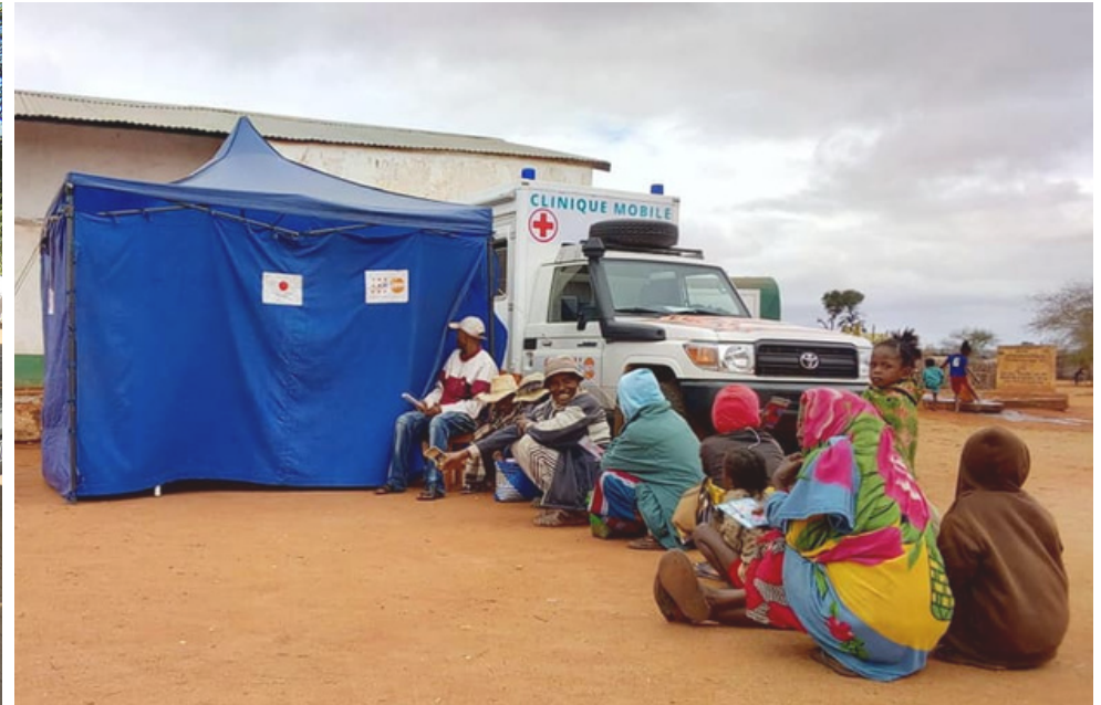
Provision of services in 119 Municipalities in the Great South of Madagascar