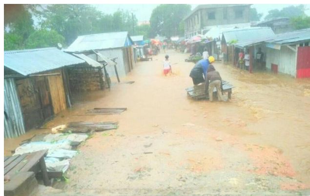
Figure 2- View of flooded neighbourhoods in Andapa, Sava region