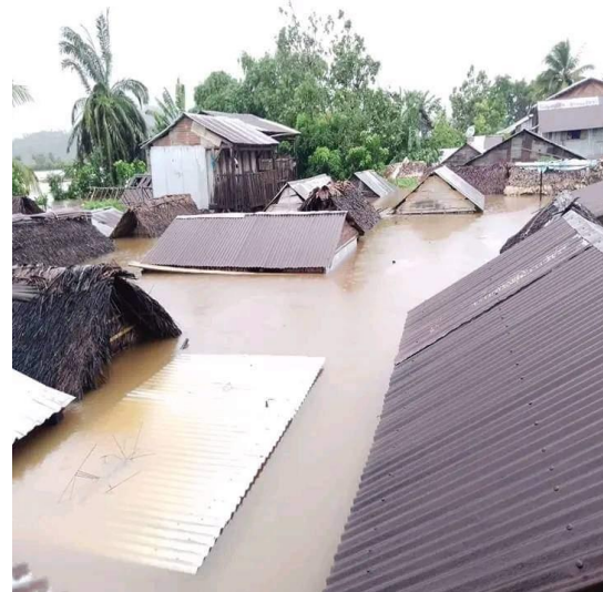
Figure 2- View of some flooded homes

An evaluation carried out by the National Bureau for Disaster Risk Management (BNGRC) indicates there are presently 7,334 people affected in seven regions. These include Diana, Sava,