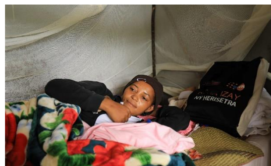
Figure 6: Nursing mother receives hygiene kit at one of the shelter sites in the Fitovinany and Vatovavy regions.