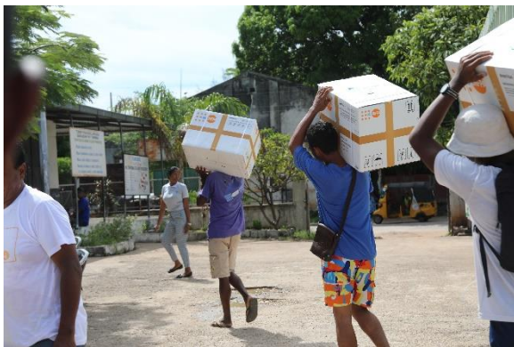
Figure 3: Emergency IARH commodities moved to the different health centres in Boeny & Sofia regions