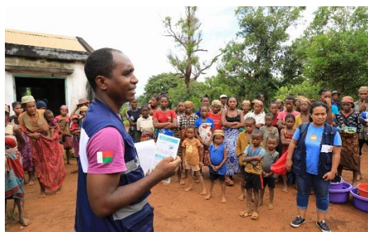
Figure 5 : Community sensitization session in the Fitovinany and Vatovavy regions.