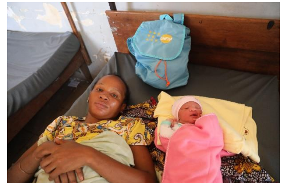
Figure 2: Breastfeeding mother having benefitted from UNFPA kit in Boeny region.