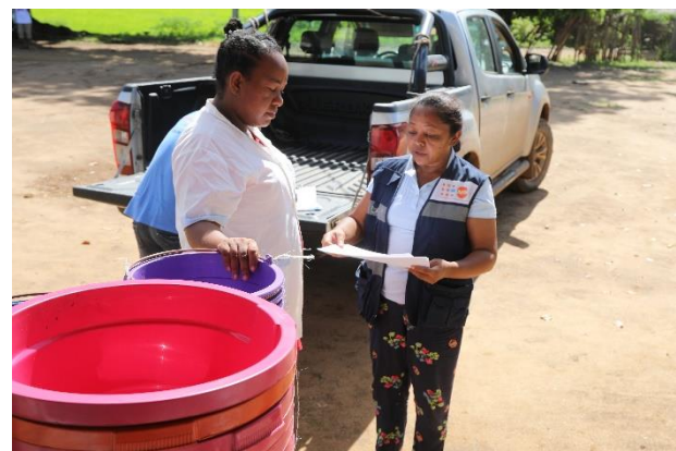
Figure 4: Reception of dignity kits