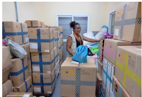
Figure 2: SRH Kits delivered at the warehouse of the Mananjary Regional Directorate for Public Health,