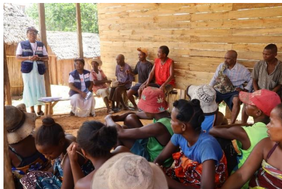
Figure 4: Social workers sensitize community on Family Planning and GBV in Menagisa.