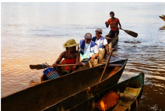
Figure 5: Social workers cross the Mangoro river to get to Menagisa, where many households were affected by floods.