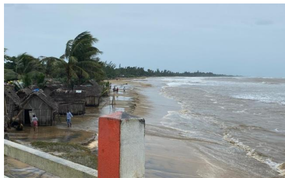
Figure 6: View of seaside village in Mahanoro, affected by water rise from the tropical storm.