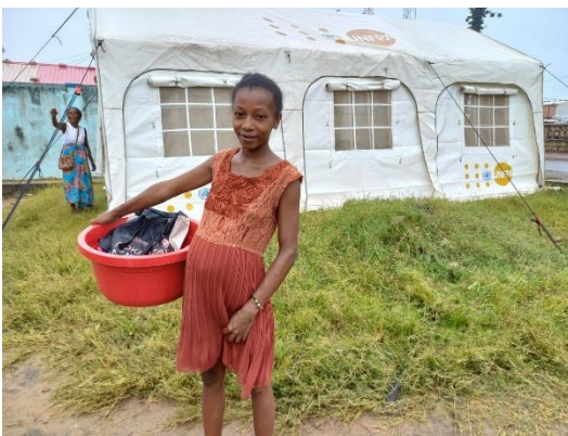
Figure 3: Woman receives dignity kit at a temporary CEJ in Mananjary.

Website – madagascar.unfpa.org ; Twitter: @UNFPAMadagascar ; Facebook: UNFPA Madagascar ; YouTube: UNFPA Madagascar