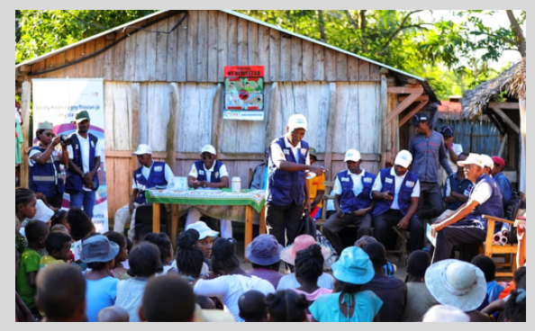
Men involved in the fight against GBV raise awareness among their peers and the entire community